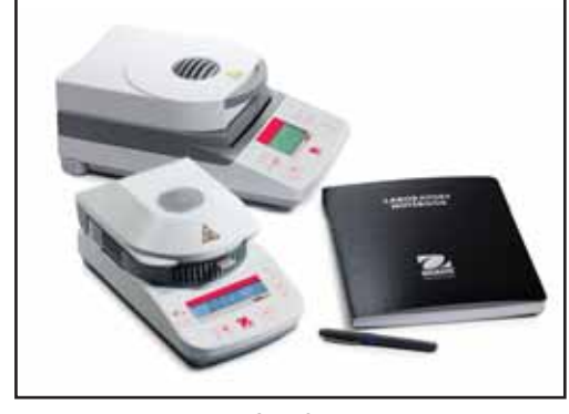
With it's small footprint, the OHAUS MB23 and MB25 are compact enough to fit on any benchtop