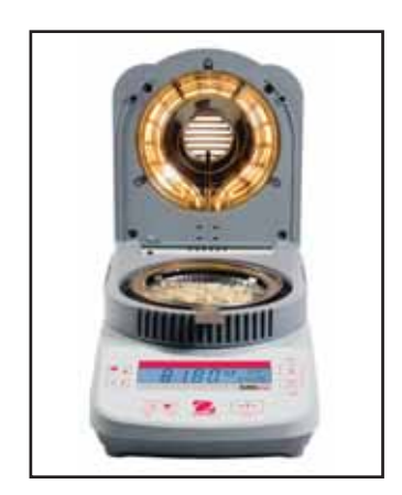
The OHAUS MB23 comes with an infrared heating element, while the MB25 uses halogen technology