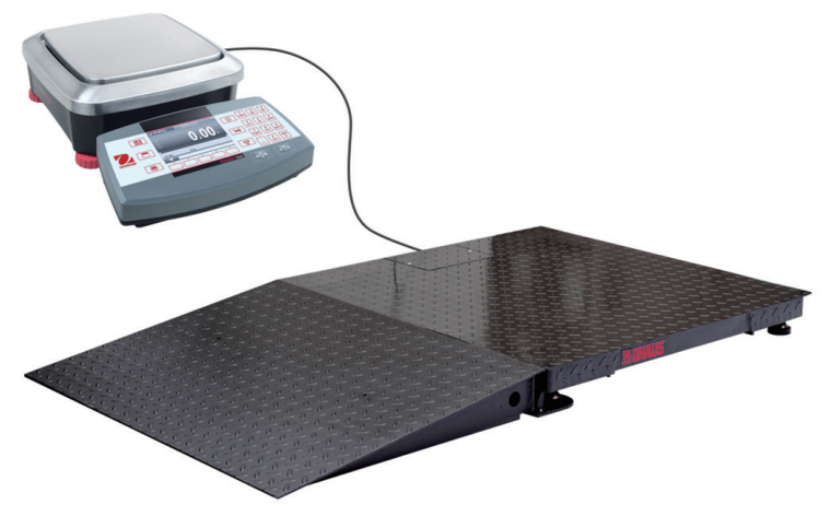
Shown with second scale option

With the 2<sup>nd</sup> scale option, you can connect a floor scale platform or bench scale base with higher capacity in order to achieve precise results for a job of any size. Results from both scales can be